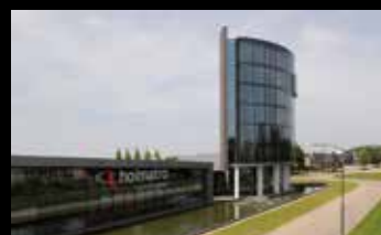
Holmatro Group Rescue equipment World Headquarters Raamsdonksveer, The Netherlands Sales & training

An efficient way of managing service requests to your qualified Holmatro dealer online. Requests through the Holmatro Service Portal are designed to be easy-to-use and always go directly to the right person or right department.