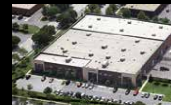
Holmatro USA Glen Burnie, MD, U.S.A. Manufacturing, sales & service