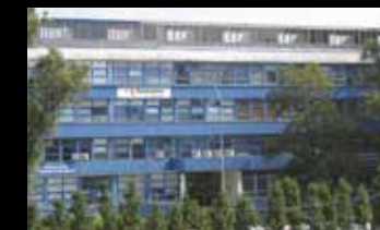
Holmatro Poland Warsaw, Poland Sales & service