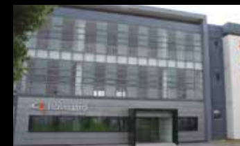
Holmatro China Suzhou, Jiangsu Province, China Sales & service