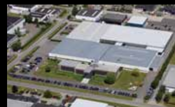
Holmatro Netherlands Rescue equipment Industrial Equipment Raamsdonksveer, The Netherlands Manufacturing, sales & service