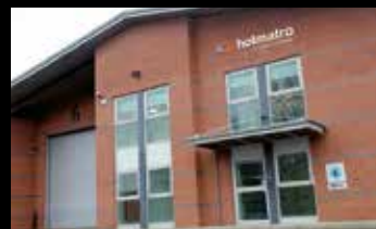
Holmatro UK Nottingham, UK Sales & service